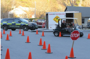
Top picture - NPD Officer questions a DUI subject. Bottom picture - Northfield Police work with the Youth Safety Council of Vermont's - Turn Off Texting Program at Norwich University. Right picture - OCS give demo during DUI class at Norwich University

County Sheriff's Department (OCS) to provided safety education for Norwich University (NU) and Northfield High school (NHS) students. Through classroom sessions, and demonstration, held on the NU campus, instructors covered the risks associated with Distracted and Impaired Driving culminating with a mock DUI crash. In addition to these demonstrations, instructors also conducted a Distracted Driving course in coordination the Youth Safety Council of Vermont's - "Turn Off Texting Program". Overall, 100 students attended to learn about the risks and implications associated with Distracted and Impaired Driving. Excellent Job!